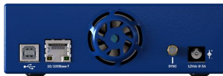
USB & 10/100Base-T Management Ports Fan Sync Port 12Vdc @ 5A